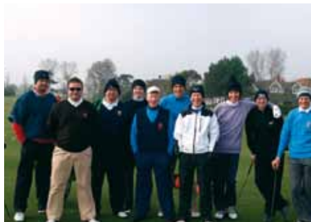
The successful team