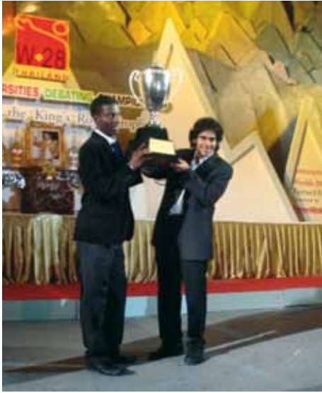
Samir Deger-Sen (2003) is the reigning debating world champion