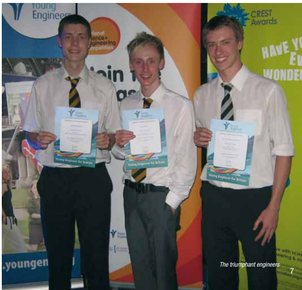
The triumphant engineers