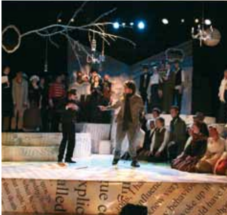
The cast of Great Expectations