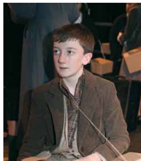
Actor from The Train Leaving Platform Four

In the countdown to the performance, the drama studio was transformed into a cramped Anderson shelter with an unexploded bomb lodged outside. Authentic 'ration book' programmes and 'evacuee name tag' tickets further added to the authentic atmosphere. The performance itself was a fascinating journey that followed the stories of four families as they underwent the horrors of the Second World War. Thought-provoking sadness was beautifully balanced by fleeting moments of genuine humour.