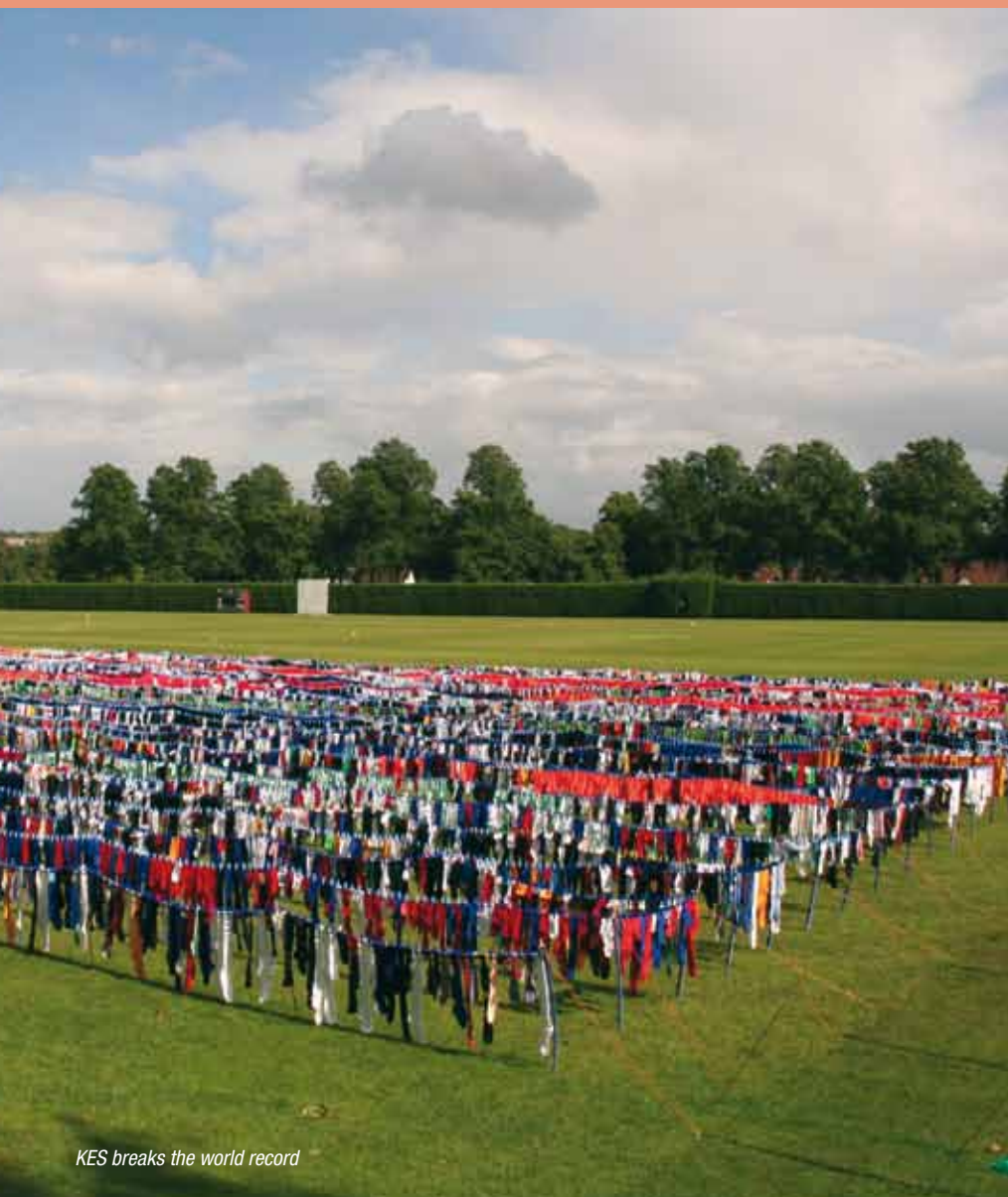
KES breaks the world record