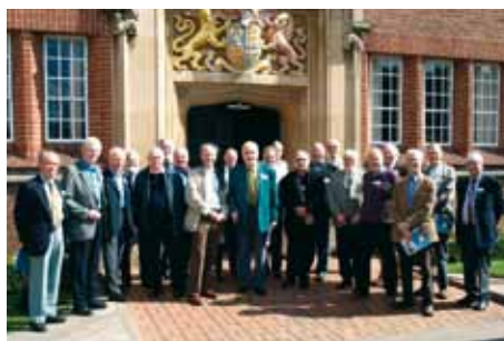
Old Edwardians attending their 1958/59 reunion. Reports on all the events taking place this year will be published in the next Old Edwardians Gazette.