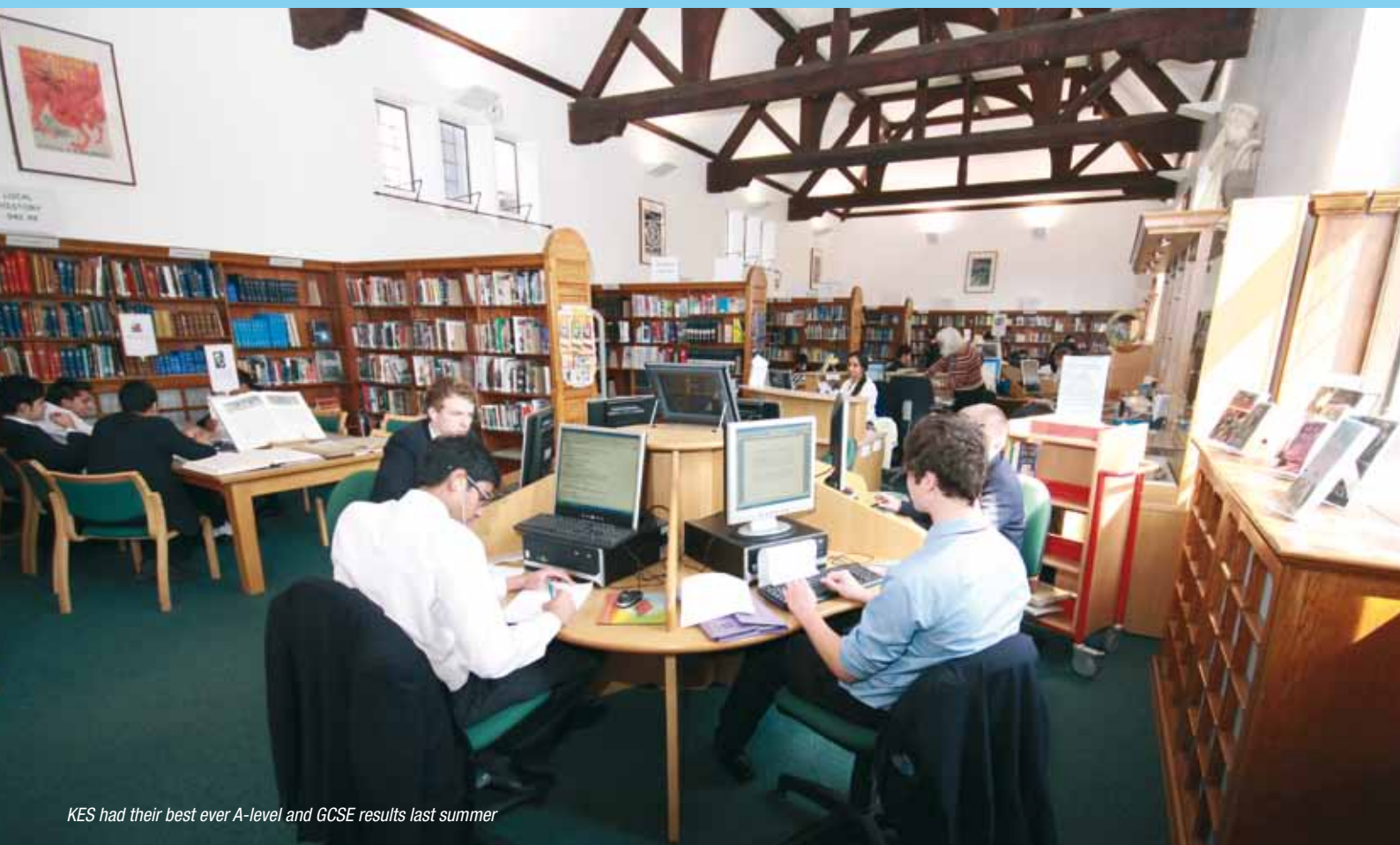
KES had their best ever A-level and GCSE results last summer