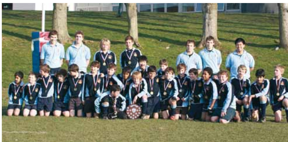
The victorious U12 KES rugby team