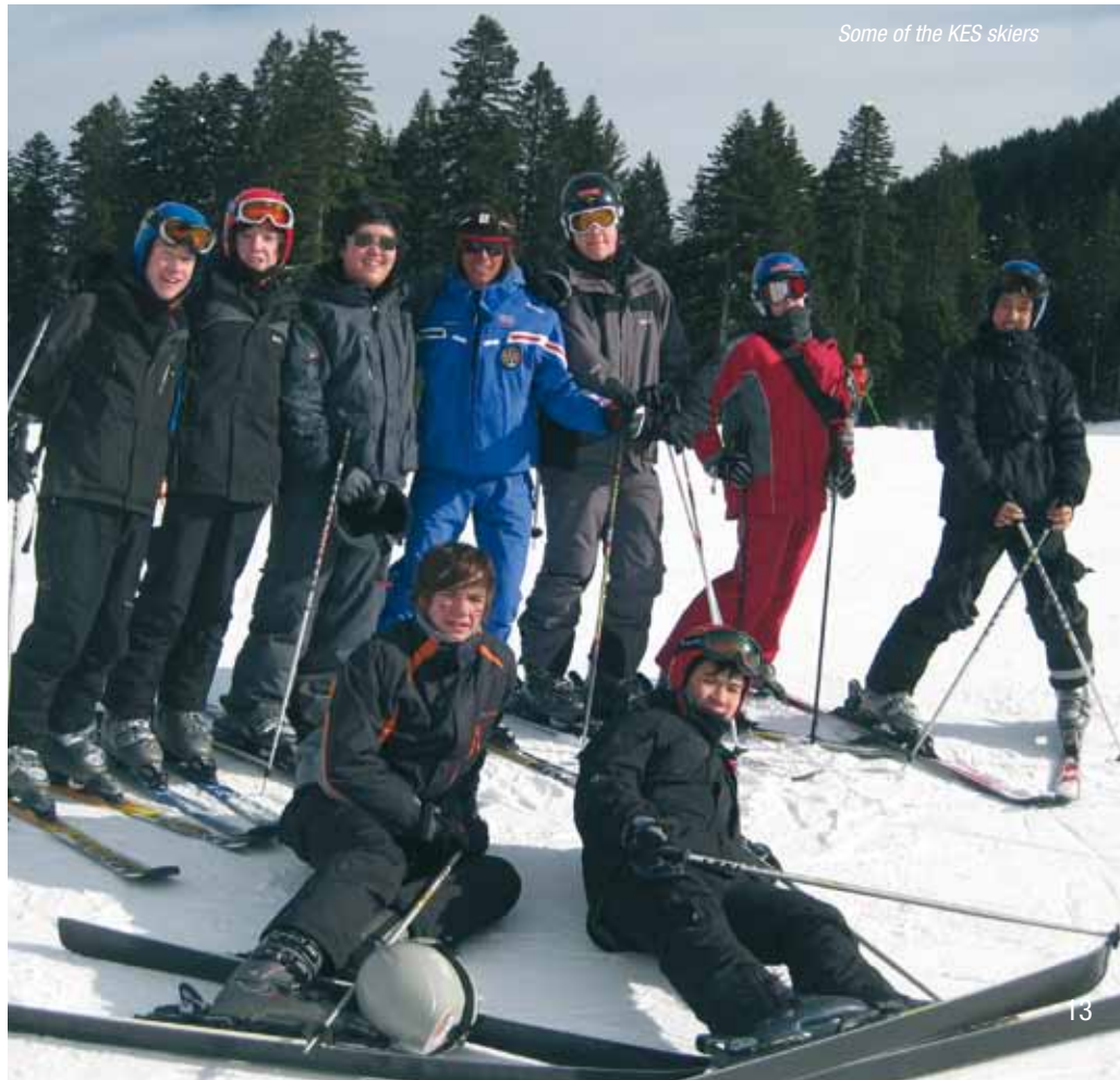
Some of the KES skiers

February half-term saw the first tandem ski trip by the KES Ski Club. Over 100 boys and staff flew to Northern Italy to stay either side of Mount Paganella in the Trentino region of the Dolomites. Several months of heavy snowfall and day after day of glorious blue skies ensured perfect skiing conditions for the trip. Their time was spent skiing on beautifully groomed pistes, eating hearty Italian food and enjoying the evening activities the area had to offer. The trip concluded with a water-taxi trip and a look round Venice on perhaps one of the busiest days of the year, the 'Start of Spring Festival'.