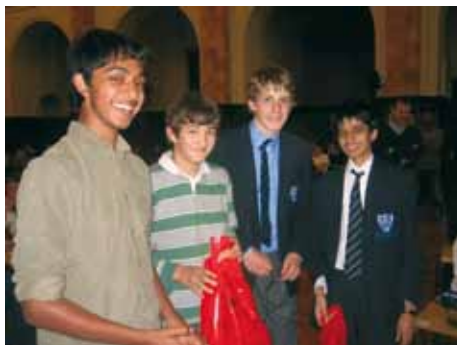
The winning KES Maths team