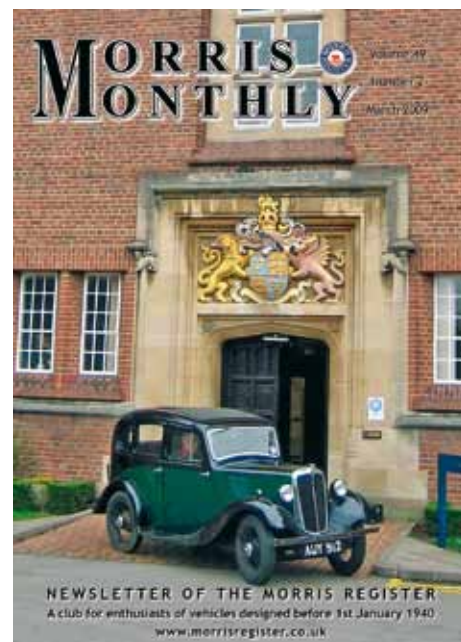
Morris Eight parked outside KES

In a scene reminiscent of 1938 (the year in which King Edward's moved to its current Edgbaston site) a Morris Eight saloon was parked outside reception for a few hours earlier this year. This particular picture featured on the front of the March edition of Morris Monthly and was taken when a committee meeting was held at KES in January. No attempt, however, was made to get the car inside the School – quite an achievement in the 1980s, when an Austin Seven was parked in the Gild Hall in the run up to a non-stop John O'Groats to Lands End charity run.